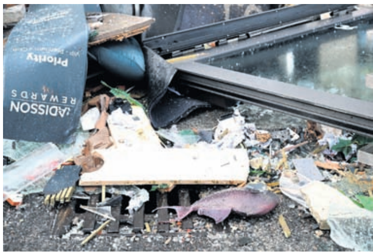
A fish lays in the debris in front of a hotel where an huge aquarium has burst in Berlin, Germany, Friday, Dec. 16, 2022.